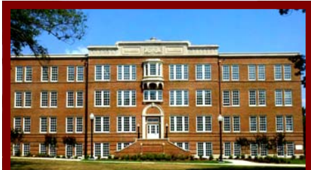
The Lloyd-Ricks-Watson Building, home of the Department of Agricultural Economics

Our faculty represent some of the leading teachers and researchers in their fields, often called upon by state and national policymakers for their analysis of current issues. They contribute their knowledge and experience to classroom teaching by not only providing students with the latest happenings in their field but also putting them in perspective.